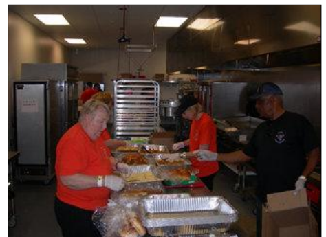
Incarnation and St. Thomas More volunteers preparing catering food for Stadium Suites