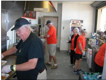
Incarnation and St. Thomas More volunteers work the front of the stand during the game